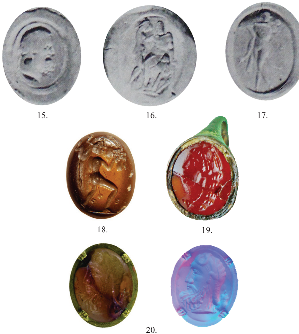
Pl. V. 15. Gem from the collection of Brukenthal Museum Sibiu, inv.no. 1058, after Țeposu- David 1965, p. 85, pl. I, fig. 14; 16. Gem from the collection of Brukenthal Museum Sibiu, inv.no. 769, after Țeposu- David 1965, pp. 85- 86, pl. I, fig. 15; 17. Gem from the collection of Brukenthal Museum Sibiu, inv.no. 1075, after Țeposu- David 1965, p. 86, pl. I, fig. 13; 18. Gem from the collection of The Numismatic Cabinet of the Romanian Academy, inv.no. 9031, after Gramatopol 2011, Pl. 1, no. 20; 19. Gem discovered at Căpreni, from the collection of „Alexandru Ștefulescu” Gorj County Museum, after Marinoiu, Hamat 2020, p. 238, no. 7; 20. Gem from the collection of Bucharest Municipality Museum, Maria and dr. George Severeanu collection, photo by C. Oprea and O. Borlean.