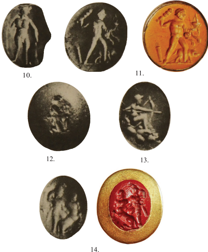
Pl. IV. 10. Gem from the collection of The Numismatic Cabinet of the Romanian Academy, inv.no. 178, after Gramatopol 1977, pp. 131-132, Pl. XIII, no. 274; 11. Gem from the collection of The Numismatic Cabinet of the Romanian Academy, inv.no. 105/3, after Gramatopol 1977, p. 132, Pl. XIII, no. 275; 12. Gem from the collection of The Numismatic Cabinet of the Romanian Academy, inv.no. 176, after Gramatopol 1977, 132, Pl. XIII, no. 276; 13. Gem from the collection of The Numismatic Cabinet of the Romanian Academy, inv.no. 179, after Gramatopol 1977, p. 132, Pl. XIII, no. 277; 14. Gem from the collection of The Numismatic Cabinet of the Romanian Academy, inv.no. 33/O, after Gramatopol 1977, p. 132, Pl. XIII, no. 278 and Gramatopol 2011, Pl. 11, no. 278.