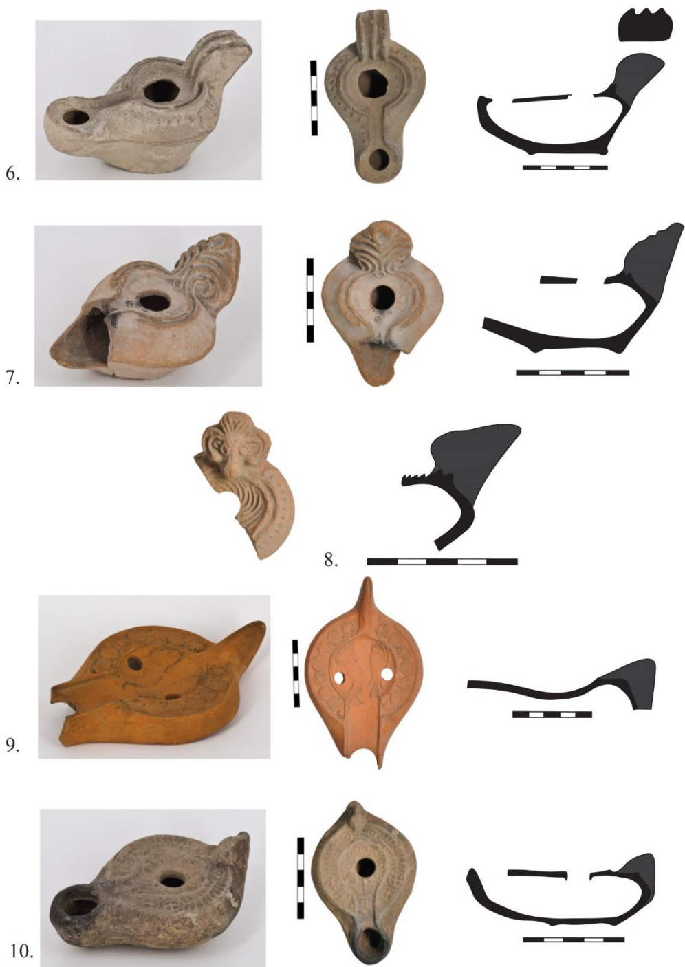
Plate II. 6-8. Balkan/Danubian lamps; 9. Tunisian lamp; 10. African type lamp.