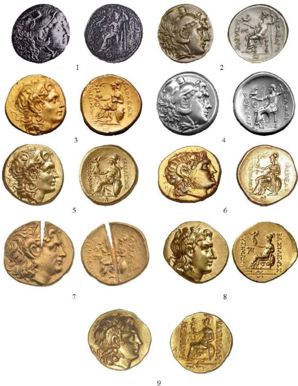
Plate I. 3 rd c. BC staters and tetradrachms from Tomis: 1-2, first issue; 3-4, second issue; 5, third issue; 6, fourth issue; 7, fifth issue; 8, sixth issue; 9, seventh issue.